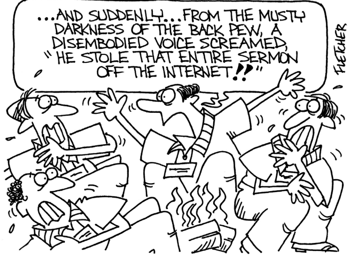
Spooky stories around the Pastor Retreat campfire.