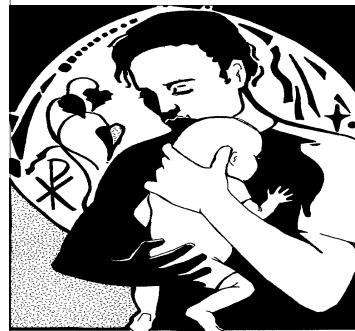
Happy Father's Day