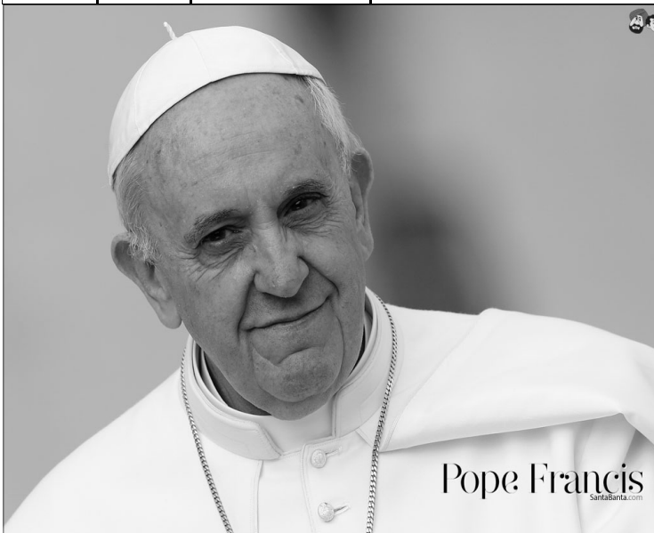
Pope Francis

“I see the church as a field hospital after battle. It is useless to ask a seriously injured person if he has high cholesterol and about the level of his blood sugars! You have to heal his wounds. Then we can talk about everything else. Heal the wounds, heal the wounds. And you have to start from the ground up.” Pope Francis