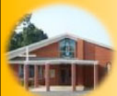
Our Lady of Mercy Henderson, La.