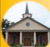
St. Joseph Church Cecilia, La.