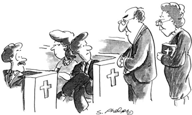
The whole church watched with nervous anticipation as the visitors sat where the Martins have sat for 42 years.