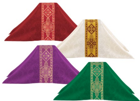
Chalice Veils $50 each