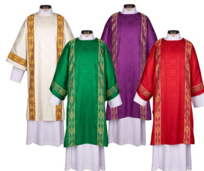
Dalmatics (Deacon Vestments) $200 each