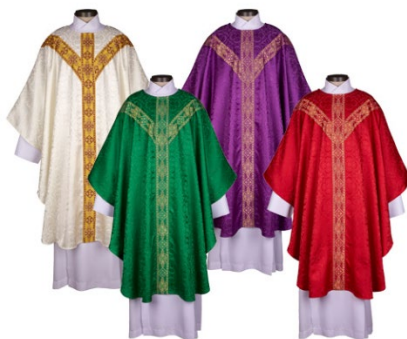
Chasubles (Priest Vestment) $200 each