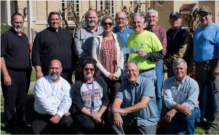
During our St. Joseph Fall Fest, the Knights of Columbus delivered a check to Rayne Catholic Elementary for upgrading the audio and visual equipment that is used for safe environment training by St. Joseph Parish and RCE. Thank you to the Knights of Columbus!