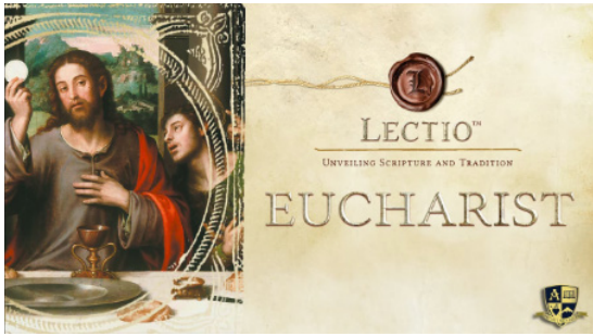
Lectio: Eucharist: Discovering the Mass in the Bible