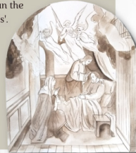
Saint Joseph Dying in the Presence of Our Lord and Our Lady