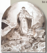
St. Joseph, Defender of the Church