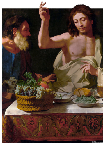
THE LORD HAS TRULY BEEN RAISED LUCAS 24, 34