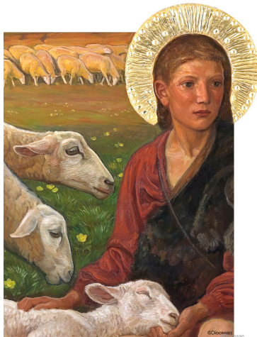
THE LORD IS MY SHEPHERD THERE IS NOTHING I SHALL WANT PSALM 23:1