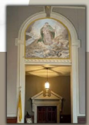
St. Joseph, Defender of the Church