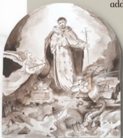
St. Joseph, Defender of the Church