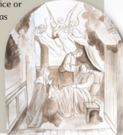
Saint Joseph Dying in the Presence of Our Lord and Our Lady