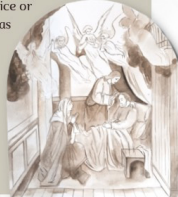
Saint Joseph Dying in the Presence of Our Lord and Our Lady