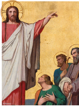
The Kingdom of Heaven is at Hand MATTHEW 10:7