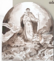
St. Joseph, Defender of the Church