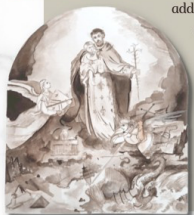
St. Joseph, Defender of the Church