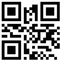
Go to CDA Court Rayne Website