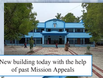
New building today with the help of past Mission Appeals