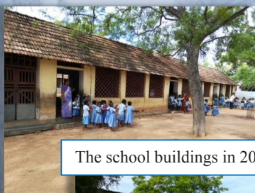
The school buildings in 2018

Currently, 382 boys and girls are studying at St. Joseph Catholic Middle School under the tutelage of 16 teachers. The school plays a vital role in the development of the community at large and Catholics in particular.