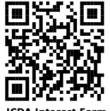
JCDA Interest Form

Interested? Let us know, scan the code. Questions? Contact jcda.cda844@gmail.com